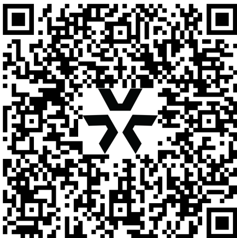
Shadow Elite Client Machines

You can view the datasheet for our most common Client PCs here: